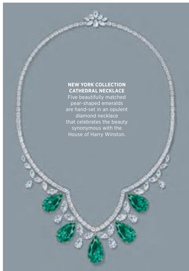
NEW YORK COLLECTION CATHEDRAL NECKLACE Five beautifully matched pear-shaped emeralds are hand-set in an opulent diamond necklace that celebrates the beauty synonymous with the House of Harry Winston.

In celebration of the city that influenced Mr. Winston, the house created the New York Collection featuring exceptional stones in defining designs that echo the city's streamlined architecture and alluring spirit. From a vibrant necklace of emeralds, sapphires, and rubies to bright, bold timepieces, these jewels have the power to inspire dreams, imagination, and a new enthusiasm for life. A personal assemblage of these special pieces can reflect so much of us: our sense of style, our femininity, our complex personalities. Why wait for a special occasion to discover your next dream piece?