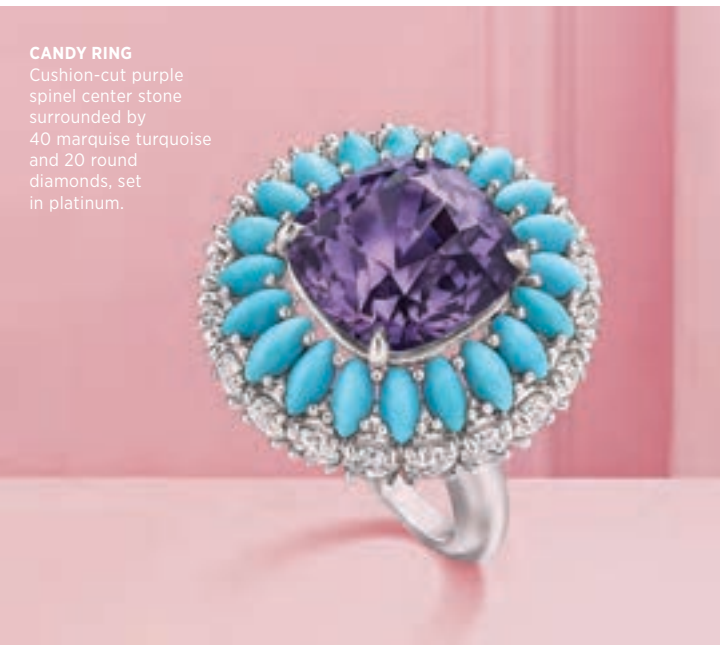
CANDY RING Cushion-cut purple spinel center stone surrounded by 40 marquise turquoise and 20 round diamonds, set in platinum.

FAMOUSLY KNOWN AS THE KING OF DIAMONDS, Harry Winston understood the power of jewelry to make you feel beautiful, vivacious, and empowered. Decades later, the House that Harry built is legendary, a place where jewelry is more than fashion—it's a personal talisman that excites and motivates. After all, every Winston jewel is a celebration: Of beauty. Of legacy. Of you.