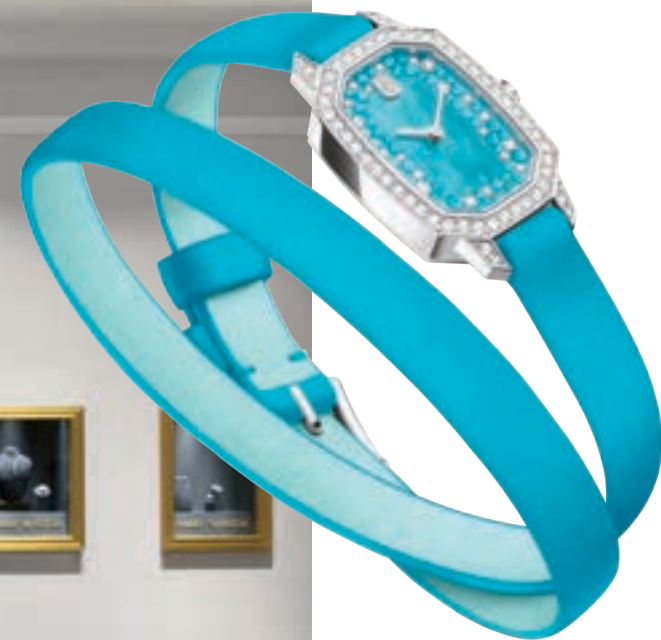
EMERALD TIMEPIECE With a winning combination of iridescent mother-of-pearl and icy diamonds, the dial of this Emerald timepiece delights with colorful cabochon adornments.