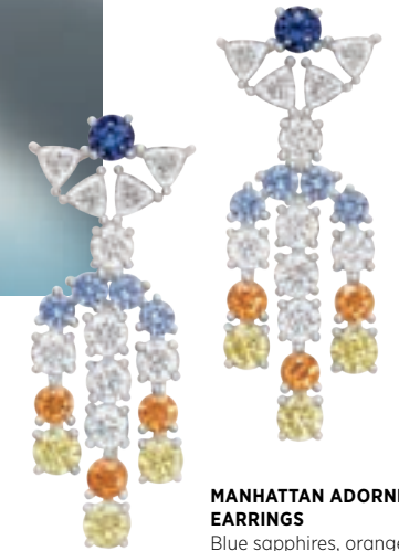
MANHATTAN ADORNMENT EARRINGS Blue sapphires, orange spessartites, and diamonds depict Manhattan's beautiful adornments.