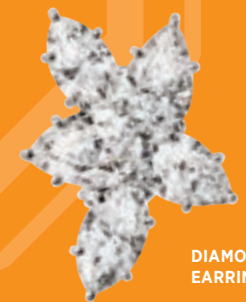
DIAMOND CLUSTER EARRINGS

JILL NEWMAN CONTRIBUTING JEWELRY & WATCHES EDITOR, TOWN & COUNTRY