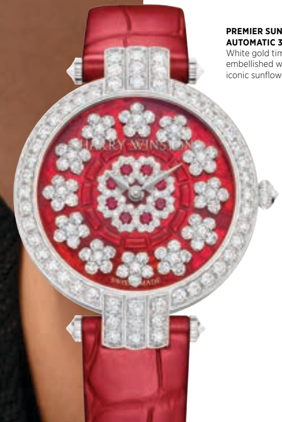
PREMIER SUNFLOWER AUTOMATIC 36 MM White gold timepiece embellished with the iconic sunflower motif.