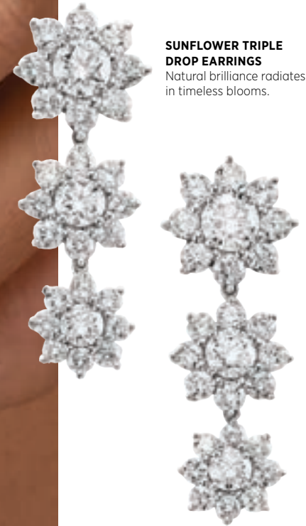
SUNFLOWER TRIPLE DROP EARRINGS Natural brilliance radiates in timeless blooms.