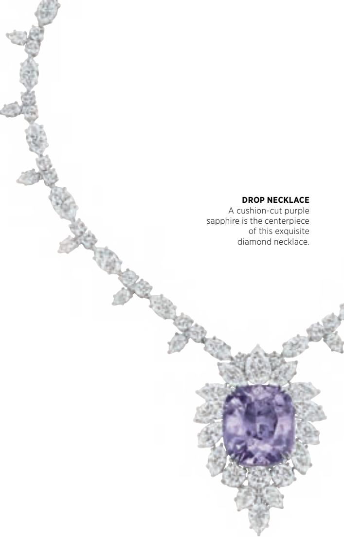
DROP NECKLACE A cushion-cut purple sapphire is the centerpiece of this exquisite diamond necklace.