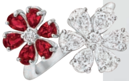
FORGET-ME-NOT RING Two exquisite ruby and diamond blossoms live side by side in this unique design.