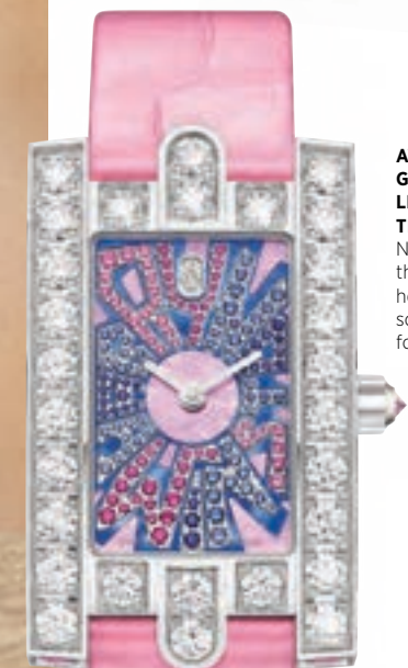
AVENUE CLASSIC GRAFFITI LIMITED-EDITION TIMEPIECE New York, the city that never sleeps, has always been a source of inspiration for Winston.