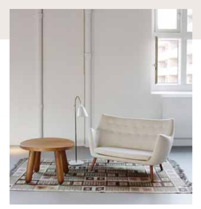
Cities That Stimulate

I really enjoy Tokyo for its idiosyncratic style. Japan can be a rigid place, but when people break free from their cultural norms, they go all out, and it shows in their dress, resulting in unusual colors and silhouettes mixed together in unexpected ways. I also find unique craftspeople in Osaka and Kobe.